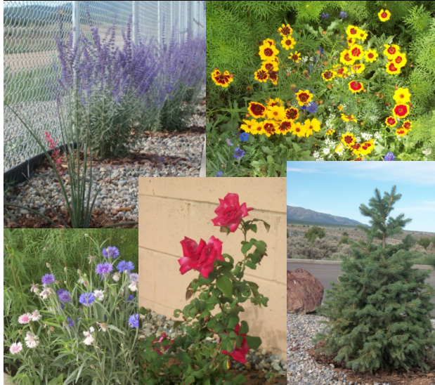
Pictured above is an assortment of the results of the landscaping efforts of El Valle staff members.