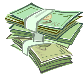
Always looking for Funding

If this money is received El Valle plans to increase the area of Phase I.