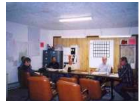
Board of Directors Meeting

Our meetings are held at 6:00 PM at the El Valle offices at 209-B Camion de La Merced.